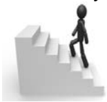
Walking up stairs