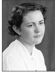
CLASS OF 1937

“Through your hard work in all you do and your dedication and service to the community, you not only will be happy yourself, but make others happy also.”