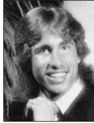
CLASS OF 1984