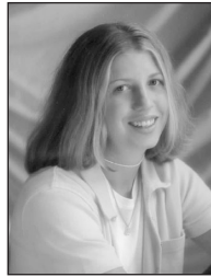
CLASS OF 1999

Soccer: 1995 Softball: 1996, 1997, 1998, 1999 Volleyball: 1996, 1997, 1998